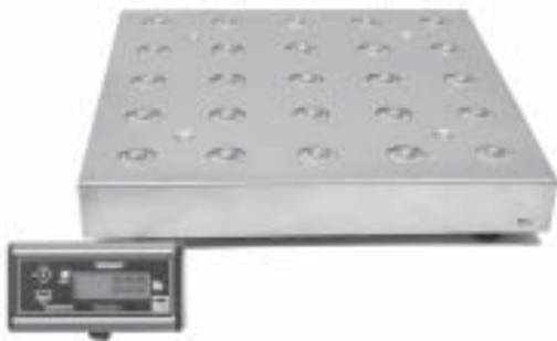
NCI Model 7885 shown with optional ball-top weight platter

The 7885 is simple to use, durable, accurate and reliable, and ideal for conveyor lines. The remote display can be placed in a convenient location to allow the user to view the weight, zero the scale, or send weight data. This NTEP approved scale fits into any operation as a stand-alone scale, interfaced to a shipping manifest software, or receiving station.